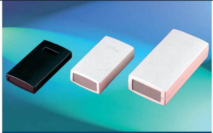
VERONEX IP64 size 1 and 2

For details of a full range of VERONEX compatible accessories, please refer to the accessories section